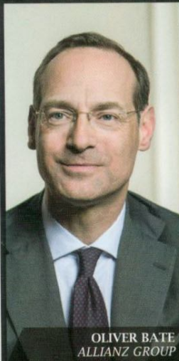
OLIVER BATE ALLIANZ GROUP