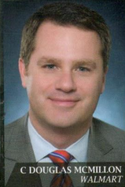
C DOUGLAS MCMILLON WALMART