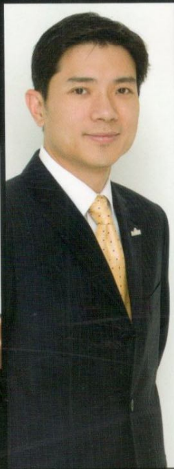
ROBIL LI BAIDU